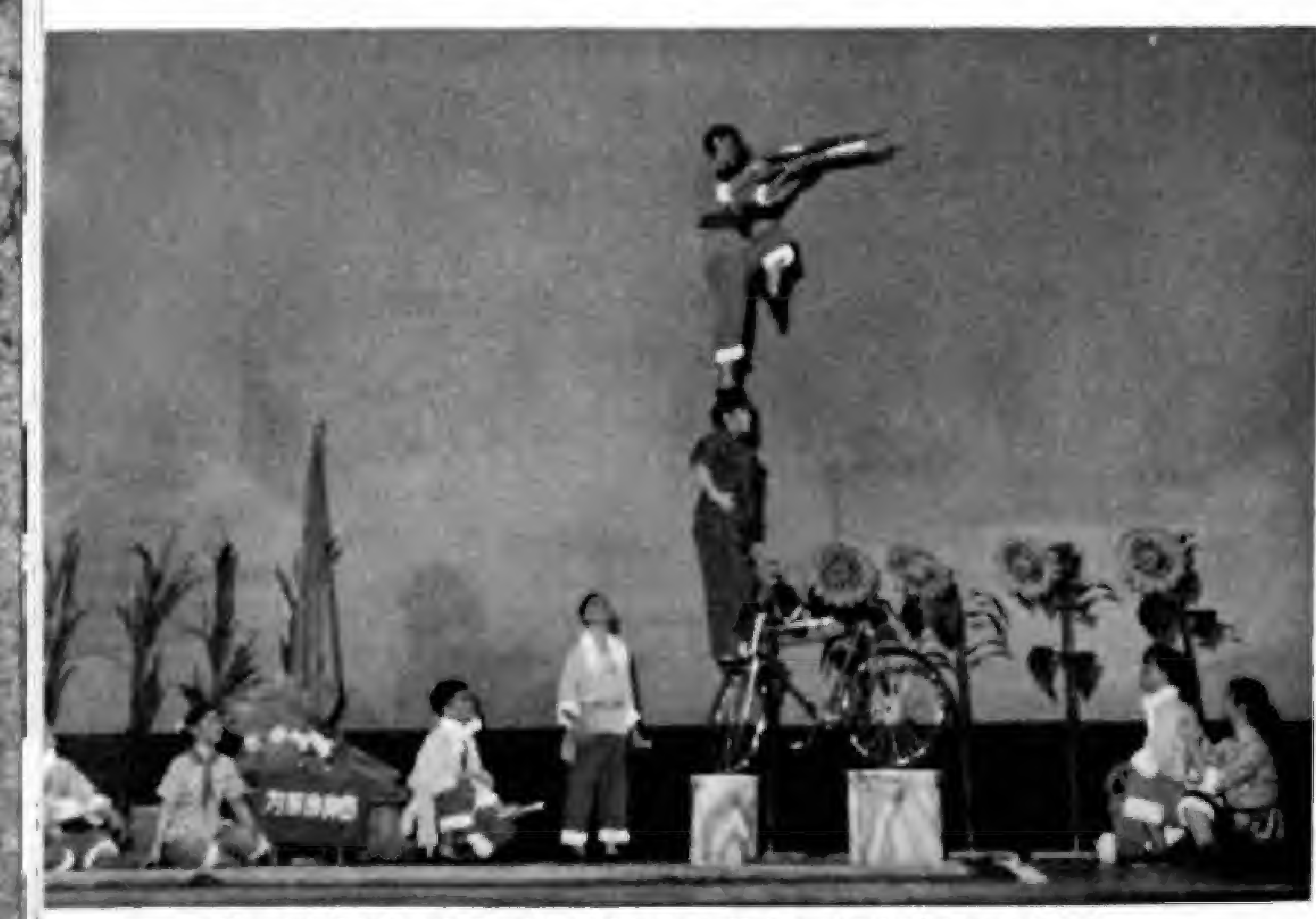
"Harvest Celebration" performed by the Wuhan Acrobatic Troupe.

poetic language, the heartfelt admiration of the revolutionary masses for all these heroes and their outstanding feats. Through iron-clad facts, the programmes showed that the heroes' indomitable spirit in transforming heaven and earth, their lofty. communist spirit of utter devotion to the people without any thought of themselves, came from the creative study and application of Mao Tse-tung's thought. Their every action, every creation and every victory glowed with its